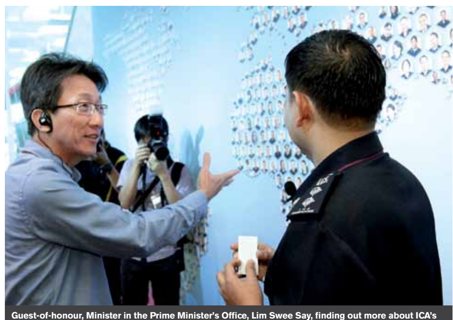
Guest-of-honour, Minister in the Prime Minister's Office, Lim Swee Say, finding out more about ICA's 800 Megawatt Smile. The 800 smiles represent ICA's total workforce at Changi Airport.